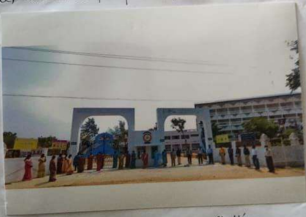
Womens awareness among staffs