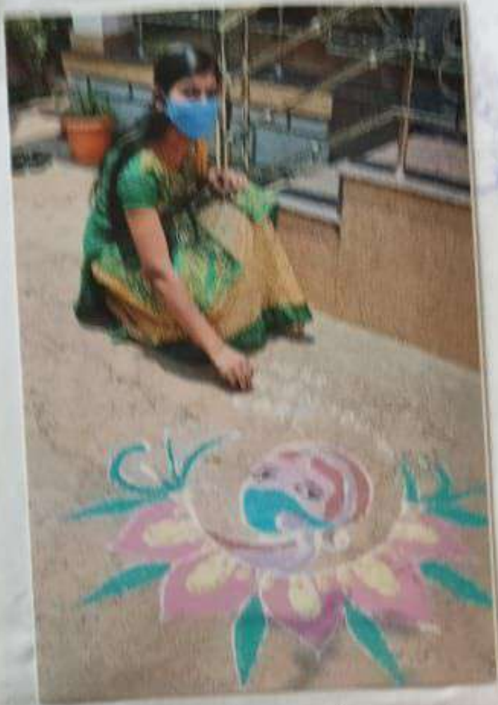
COVID-19 awareness work - Rangoli, posters as per Dr. MCA Medical Univ. guidelines.