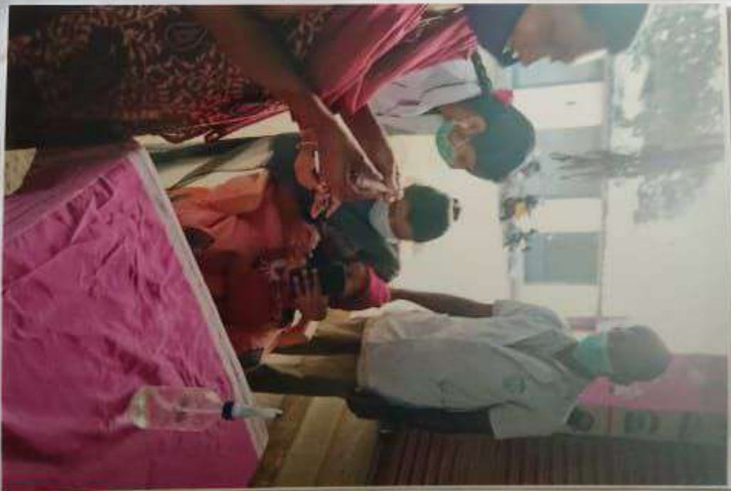
pulse polio camp at PHC, Vadakkangulam